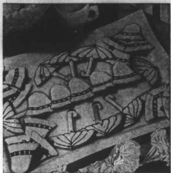
Some wedding bell and "umbrella" cookies. Use them with Mocha punch.