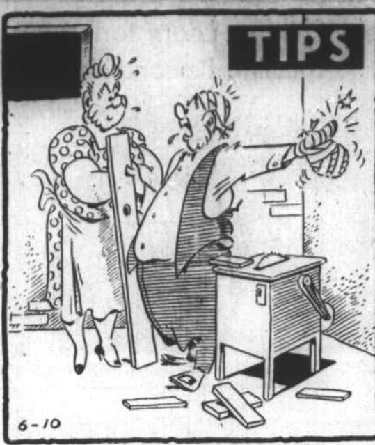
"... I'm selling this power saw with a NEWS-TIMES classified ad — before I run out of fingers!"