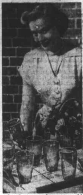
Smart new glassware adds glamour, but costs very little.

By VIVIAN BROWN AP Newsfeatures Writer ONE OF THE JOYS of warm weather is outdoor dining. Years ago backyard and terrace dining were limited to picnic type fare. But with the advent of chic weatherproof furniture outdoor dining took on a new glamor. Now the family may enjoy breakfast, lunch and dinner outdoors when the weather is nice. The table, chairs and cushions may remain outdoors. Even the plastic table cover or place mats will not