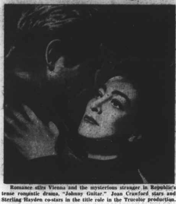
Romance stirrs Vienna and the mysterious stranger in Republic's tense romantic drama, "Johnny Guitar." Joan Crawford stars and Sterling Hayden co-stars in the title role in the Trucolor production.