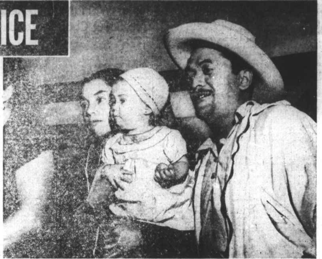
This is better than a bull fight—and daddy smiles broadly.

Pictured here is a performance in the bull ring at Guadalajara, Mexico.