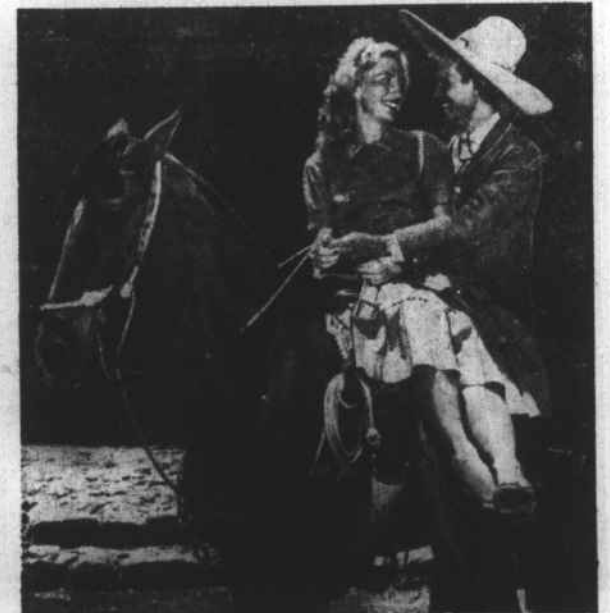
It's a pleasant holiday for one of the skaters who has a ride with a cowboy from neighboring ranch.