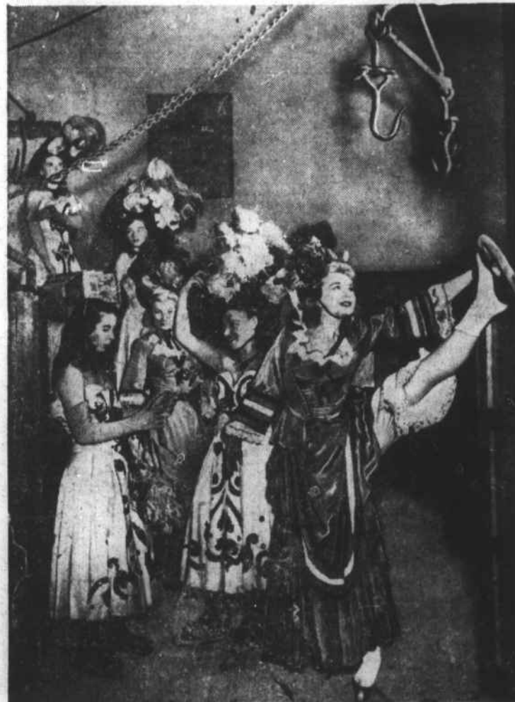
Dressing room at the Guadalajara bull ring is same room where bulls are slaughtered and meat given to poor after fights. Note the hooks.