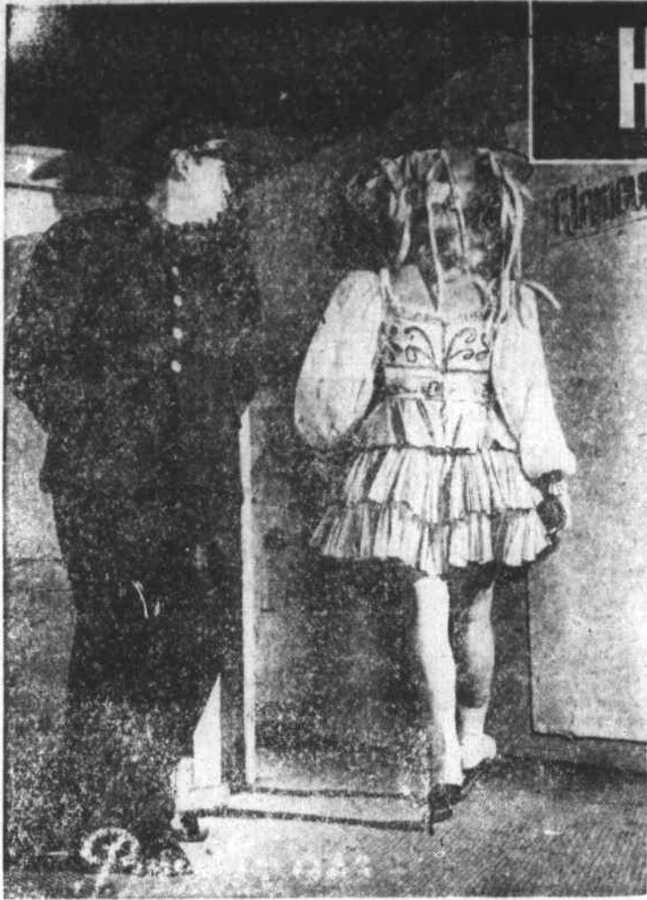
Glamor gal gets appreciative whistle from policeman.

Ice has always been a novelty in Latin America ever since the middle of the 19th century when a Boston sea captain carried some packed in sawdust to a Caribbean port. The natives went wild about it. Now they're getting ice for another purpose—a revue with pretty girls on skates performing in arenas where bull fights had heretofore been the main attraction.