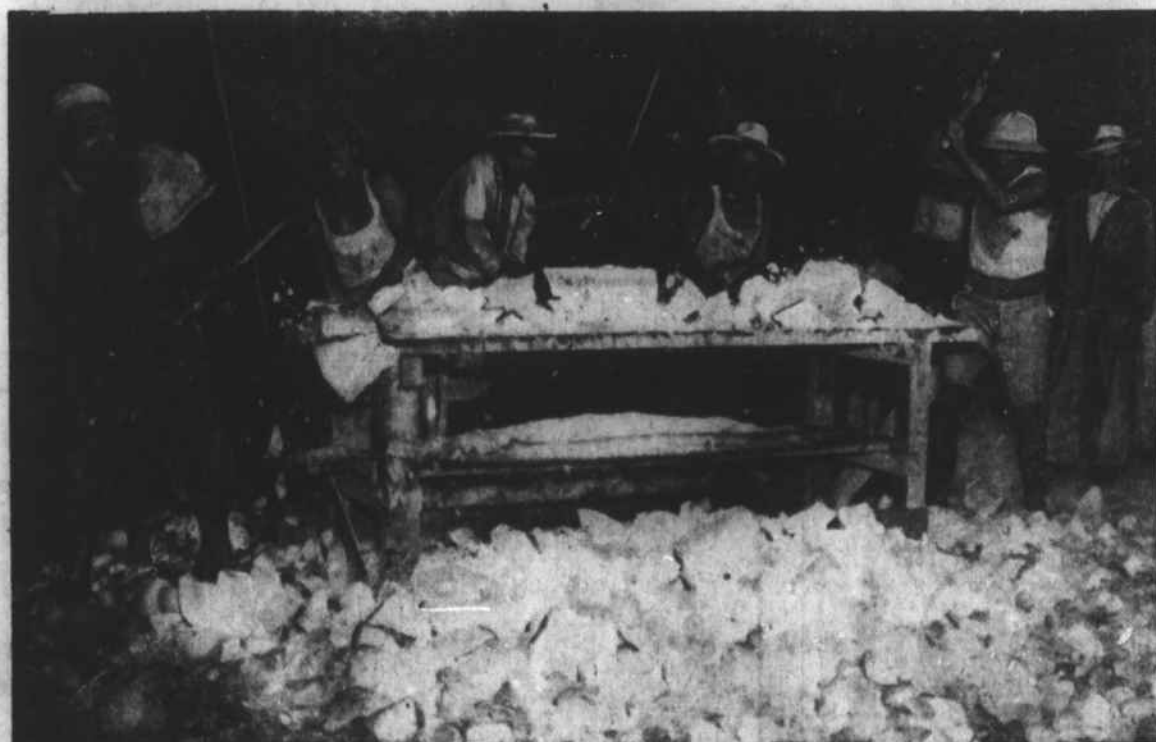
Workmen use sledge hammers to crush ice blocks in order to pack them between brine pipes to hasten freezing.