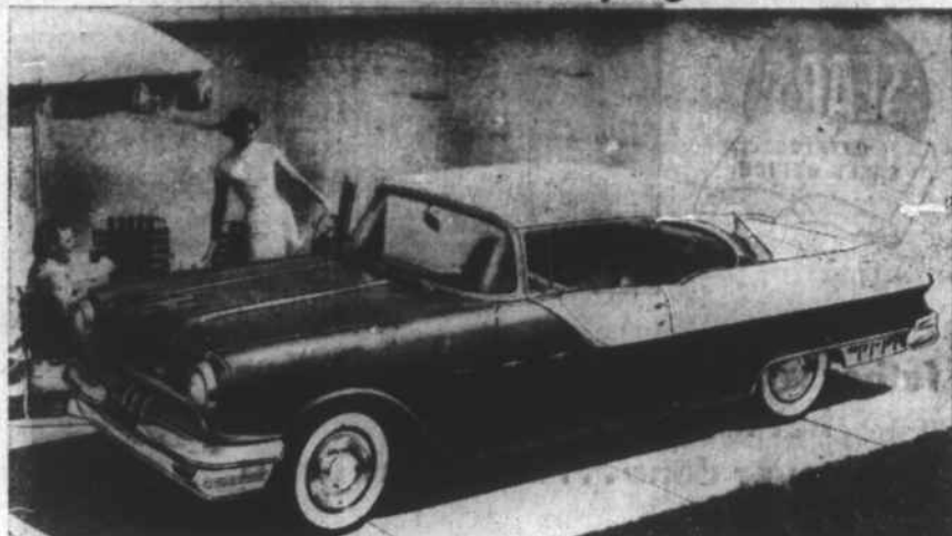
"Vogue" two-toning and new panoramic body styling enhance the long sleek look of the all new 1955 Pontiac Star Chief Custom Catalina. Powered with Pontiac's new 180 h.p. Strato-Streak V-8 overhead valve engine, the very popular Catalina is offered in Star Chief Custom and Chieftain 870 models.