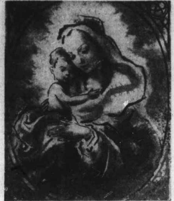
This monochrome watercolor by Flora Smith is fine example of contemporary work of religious art.

Pictured here is a cross-section of contemporary Christmas art as presented by the American Artists Group.