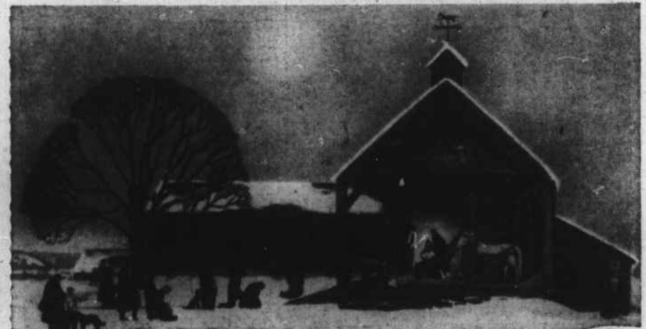
Ruth Ray painted this beautiful Nativity scene in contemporary New England.