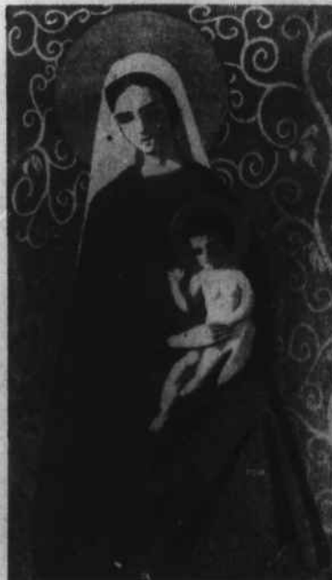
Sculptured beauty in Eyvind Earle's modern print of "Mother and Child."