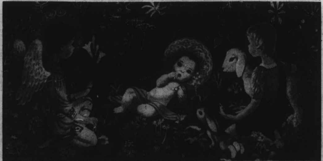
Sheilah Beckett's picture shows an artist's genius for giving new beauty to a timeless religious theme.

This Week's PICTURE SHOW—AP Manufacture.