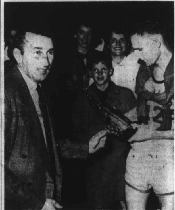
Beaufort High School basketball team copped District 2 basketball trophy.