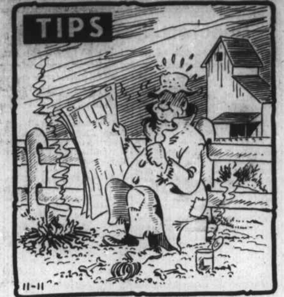
"... here's a reward in THE NEWS-TIMES classified ads