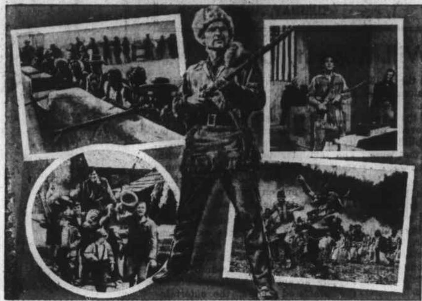
Fess Parker portrays the title role in Walt Disney's feature film of the life of the immortal frontiersman. The scenes depicted are: The siege of the Alamo (top left); the hero's homecoming (bottom left); Crockett in the U. S. Congress (upper right); and the charge of the Creek Warriors (bottom right). Film is in color by Technicolor, wide screen and is released by Buena Vista.