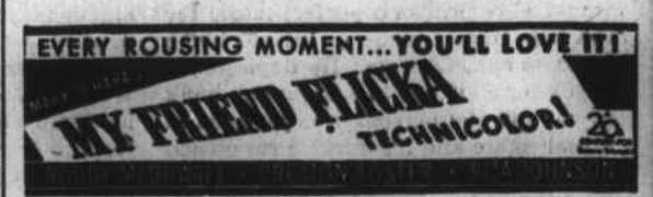
EVERY ROUSING MOMENT...YOU'LL LOVE IT! MY FRIEND FLICKA TECHNICOLOR!