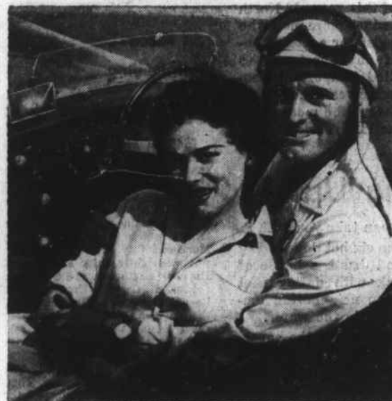
Romance—Kirk Douglas and Bella Darvi are the romantic couple in "The Racers." Their tender love story furnishes a vivid contrast to the speed and action of Hans Ruesch's novel about sports action of Hans Ruesch's novel about sports car racing from which "The Racers" was adapted. Douglas plays a champion race driver and Miss Darvi is a French ballerina, who forsakes her art to travel the race circuit with her man.