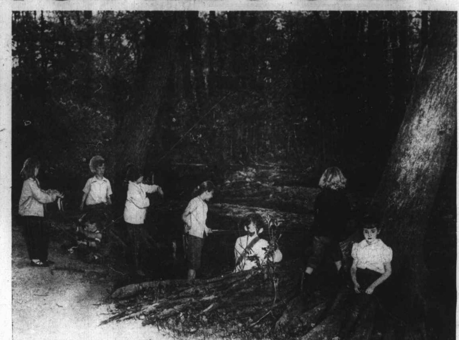
The ol' fishin' hole. Boys and girls together, the young anglers patiently wait for a nibble. Tiny miss at left shows the two she's caught.