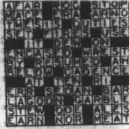
Solution to Tuesday's Puzzle