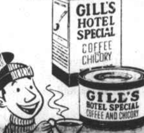
TRIUMPH OF THE BLENDER'S ART

The superb flavor sends you! That's why you'll go for delicious Gill's Coffee too. An unbeatable blend of finest coffees plus a dash of seasoning for extra strength, real economy and rich, velvet-smooth flavor.