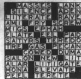
Solution to Friday's Puzzle