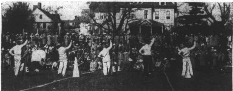
Dads get tip in cheering from Brown University cheer leaders, Pembroke is part of Brown.

Much to their amazement, the girls found that their dads had a lot of stamina. The oldsters zipped through a long Friday night of square dancing, then arose bright and early next morning to stroll the grounds, their distinguishing white caps perched jauntily on their balding, greying heads. They attended classes with their daughters, toured the grounds and buildings, met with the faculty. They cheered and sang college songs at the field house, attended a football game, and then went out for another big evening. When they left Pembroke Sunday night they still seemed fresh.