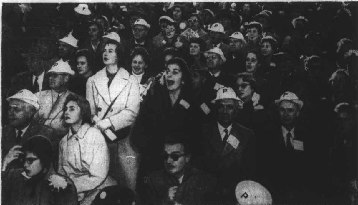
It was a sea of white caps--and Dads--at the stadium. When their daughters cheered, they did likewise--that is, some.