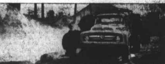
"I earn as much as $30 a day more because my Ford T-800 tandem job can carry more payload than comparable trucks," says timber-hauler Clarence Lending.