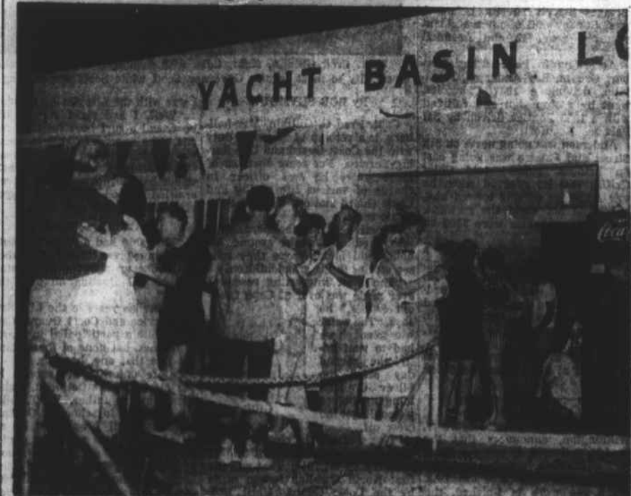
Lack of moonlight did not bother Tar Heel yachtsmen at their dance Labor Day weekend. Floodlights at the Morehead City Yacht Basin lighted the area. The dance was held Saturday night during the Tar Heels Afloat holiday weekend cruise.