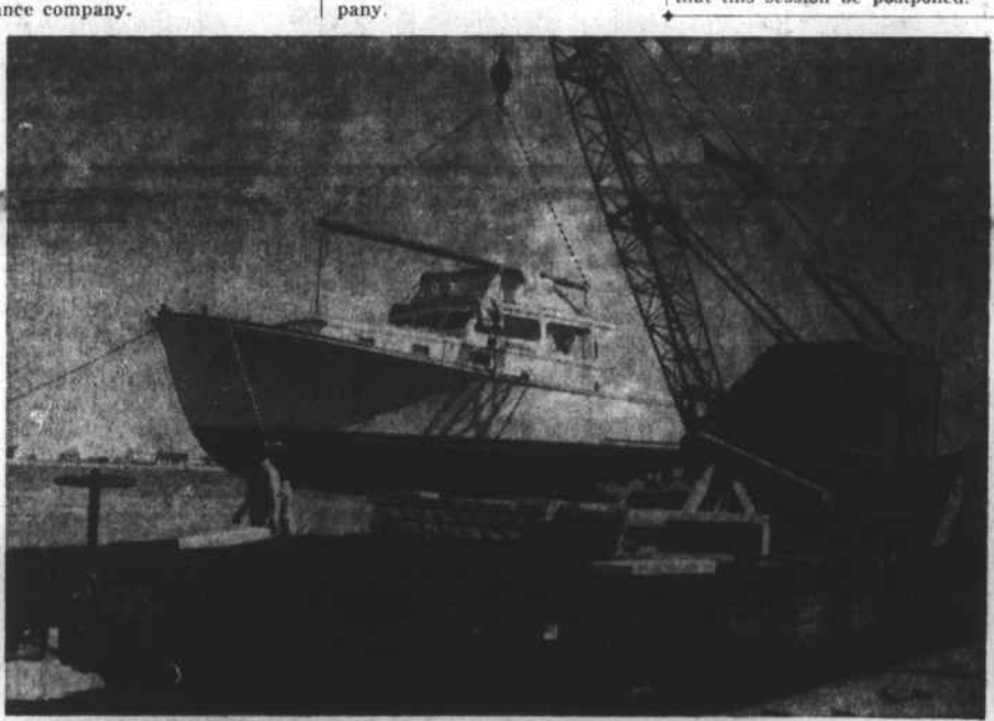
Hanging high and dry over the water at state port, the Willis Craft is being maneuvered into position for a pass at the flat car in the foreground. Spectators had to help push the car 10 feet down the tracks to meet the boat. Paul Gillikin, A&EC Railroad trainmaster from New Bern, was on hand to see that everything moved on schedule.