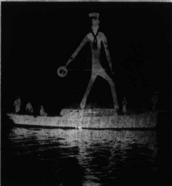
The Coast Guard's float drew a big round of applause from the thousands of people lined along the Morehead City waterfront for the water pageant Wednesday night. It won two prizes.