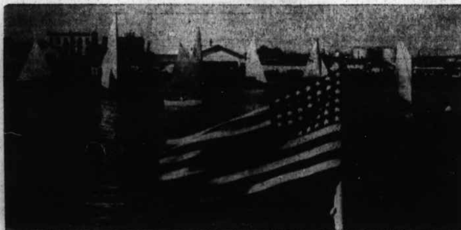
A swift tide made things difficult for small boats Wednesday afternoon. Boats in the different divisions circled in the Morehead City channel waiting for the start of the races. On the right is an eight-foot pram. Other boats are spritsails, comets and blue jays.