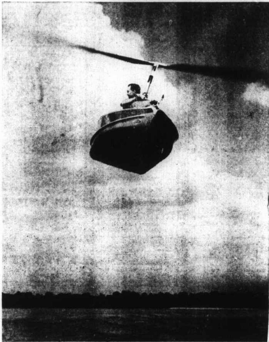
This flying boat fascinated visitors to the Morehead City waterfront during Centennial week. The boat is manufactured at Raleigh and is demonstrated here by a salesman. It is towed behind another boat and upon reaching a certain speed, it leaves the water and flies through the air. The gyro blades on the top of the boat help stabilize its motion and make for easy landing when the towboat slows down.