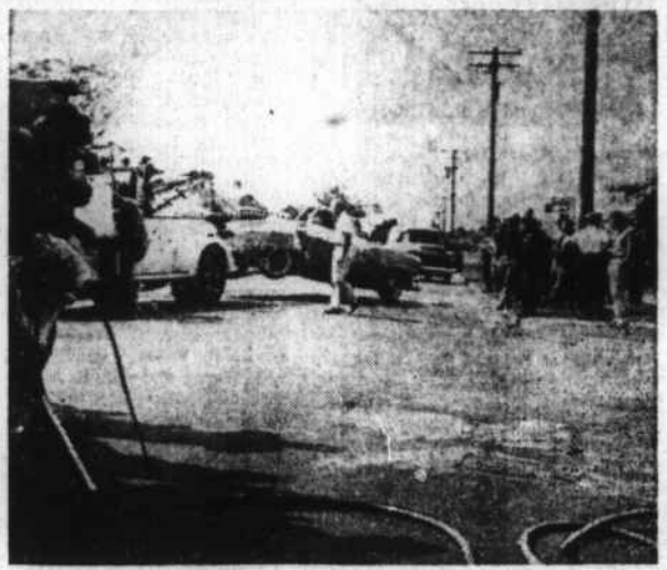
Morehead City firemen sprayed foam on the street after gas began to leak from the wrecked car. Here a wrecker prepares to tow the car away.