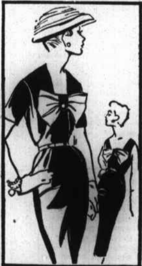
B. Sunback sheath plus jacket, Gray, navy, aqua, pink, 14 1/2-22 1/2, 5.99

There's room in every budget for good taste! We'll prove it!