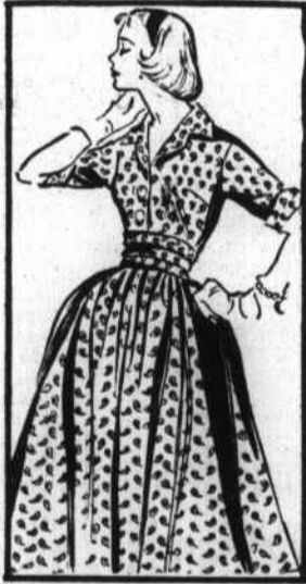
C. Paisley print on white ground, whirling skirt, 7-15, 5.99