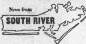
News from SOUTH RIVER