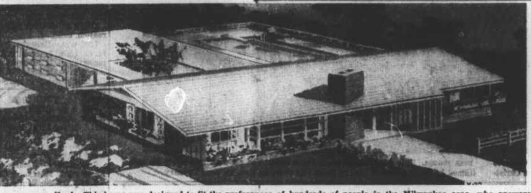
A dream you can afford: This home was designed to fit the preferences of hundreds of people in the Milwaukee area, who answered 33 probing questions in a survey aimed at discovering the house of their dreams. It has three bedrooms, with oversize formal and informal living areas. Most important, it has been cost-estimated in the Milwaukee area — without garage or optional swimming pool — at $20,000. It was planned for a lot 80 feet wide.

and also can serve as a foyer powder room.