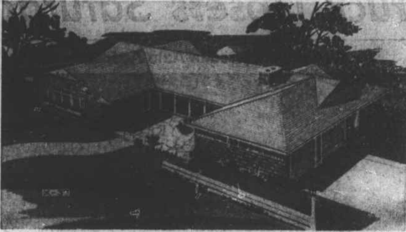
Tomorrow's home today: This gracious ranch is designed to take advantage of all the modern scientific aids to home comfort and housekeeping, from a touchplate lighting system to permanent vacuum cleaner ducts. The home has three bedrooms, large living room, dining room and kitchen. Habitable area is 1,595 square feet.