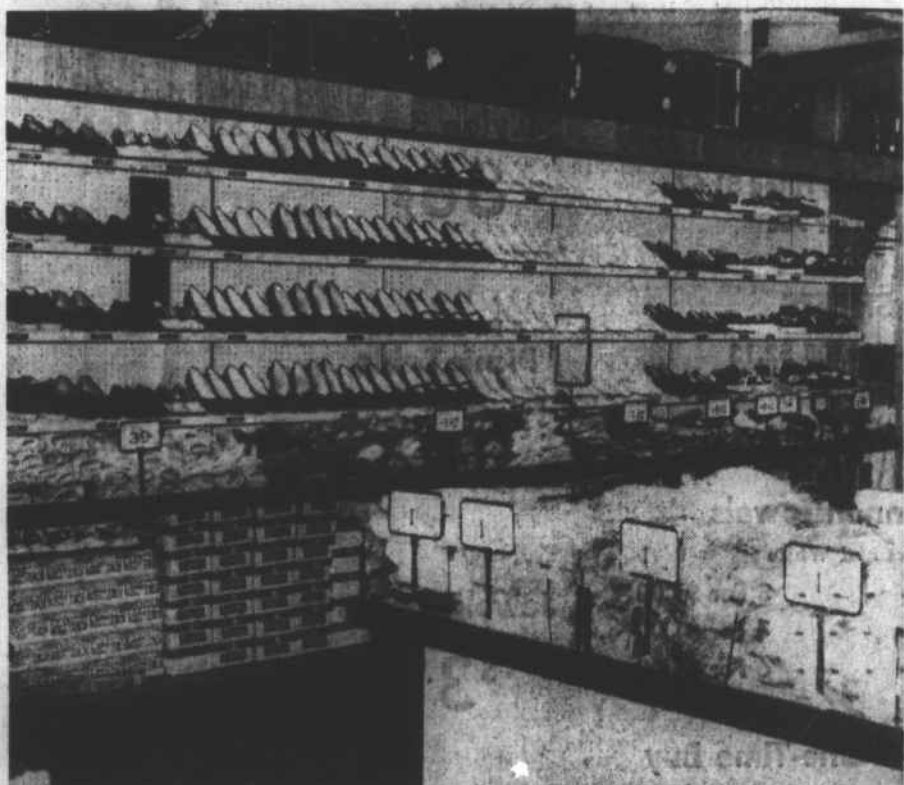
This is the much-enlarged shoe department, also self-service. All clerks now wear brown nylon smocks so they are easily distinguishable from customers.