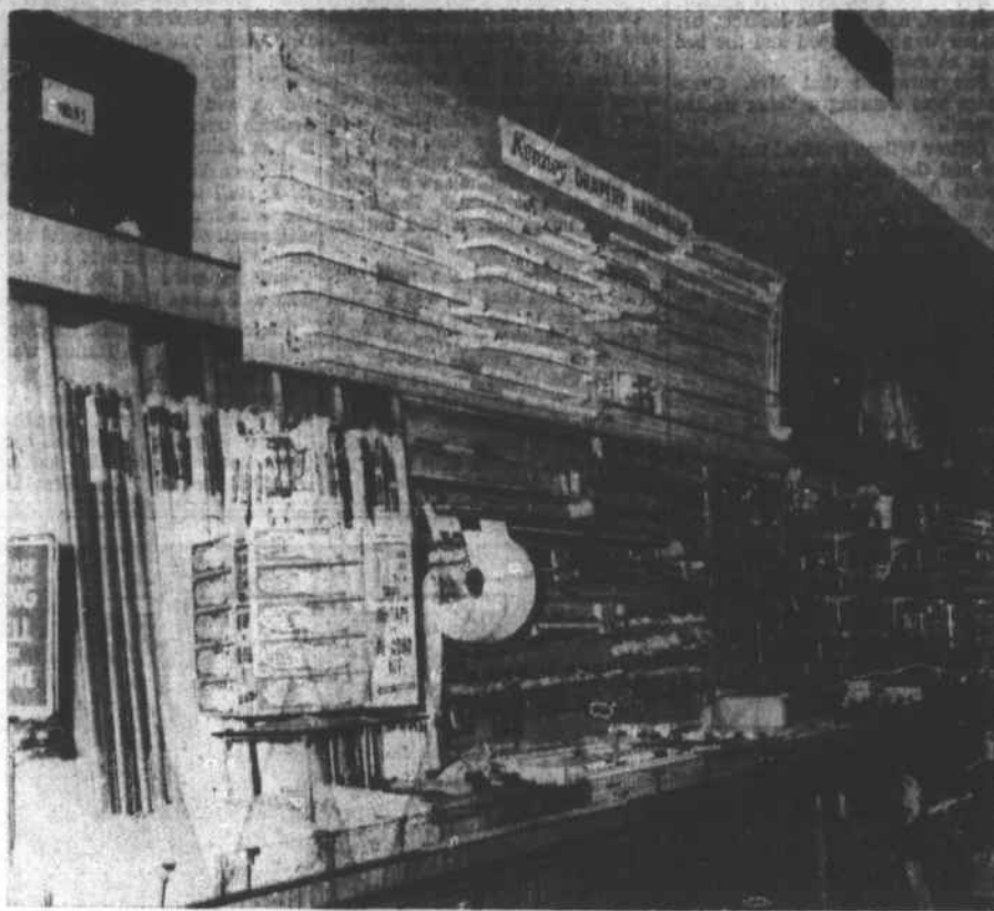
This is the new complete line of drapery hardware, conveniently displayed for the self-service shopper.