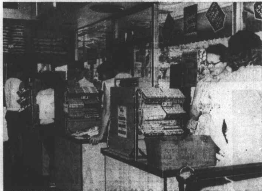
Customers check out their purchases, which they have collected in blue canvas shopping bags provided by the store.