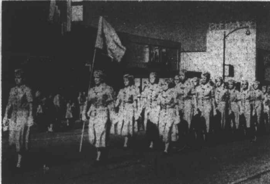
Women Marines in their summer uniforms marched in the Armed Forces parade Friday afternoon in Morehead City.