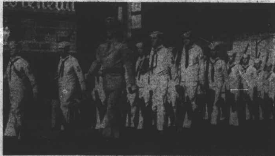
Coast Guardsmen step it off along the line of march on Arendell Street Friday afternoon.