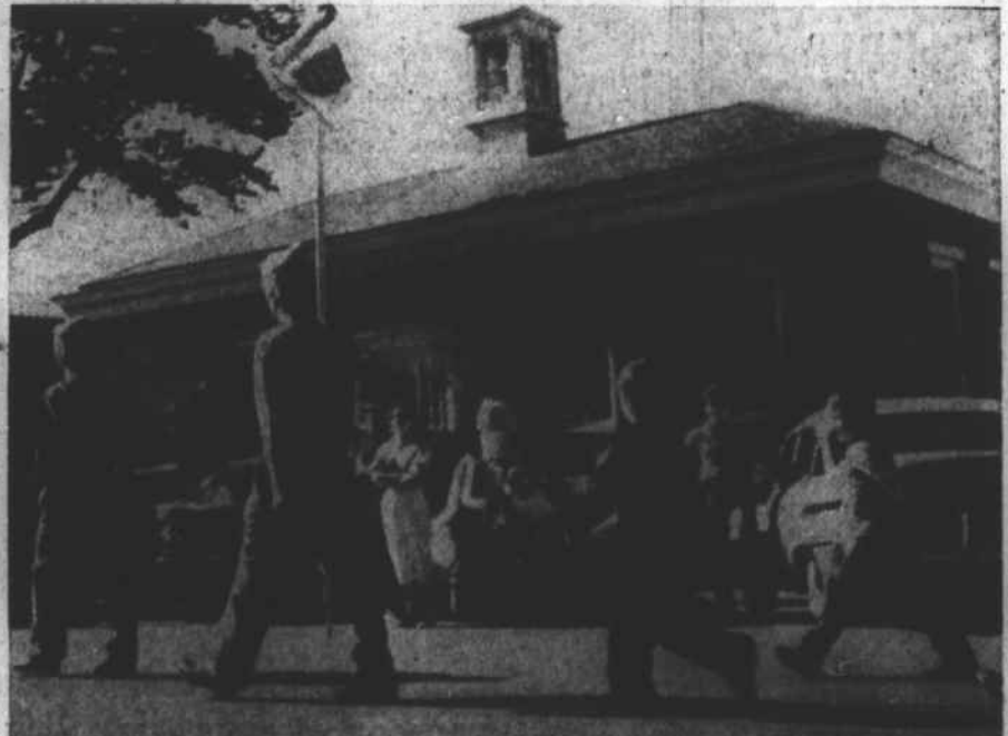
The inevitables in every parade are the small fry trotting along on heels of uniformed, marching men. Here two little fellows do their best to keep up with their idols.