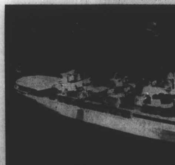
The Unimak, Coast Guard Reserve training ship, will be open to the public tomorrow and Sunday at the state port, Morehead City. Open house hours are 9 a.m. to 5 p.m. The ship will dock at 5 this afternoon and leave Morehead City at 4 p.m. Monday.