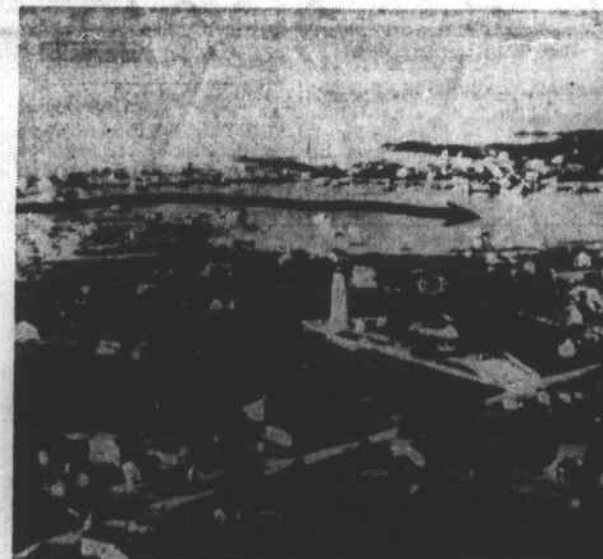
The arrow shows the entrance to Silver Lake at Ocracoke. The ferry will enter the lake and proceed to its dock in front of the Silver Lake Inn.