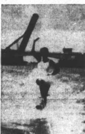
Sixteen-year-old Donna Arledge is already a veteran water skier. She is shown riding one ski; her other foot holds the tow rope.