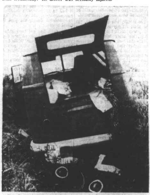
Doughnuts being carried in the truck littered the highway and field where the truck finally came to a stop after hitting a barbed wire fence. White marks in foreground encircle doughnuts.

Damage to this 1958 Volkswagen panel truck was estimated at $800. The truck left highway 24 at 8:20 a.m. Wednesday. Its driver was seriously injured.