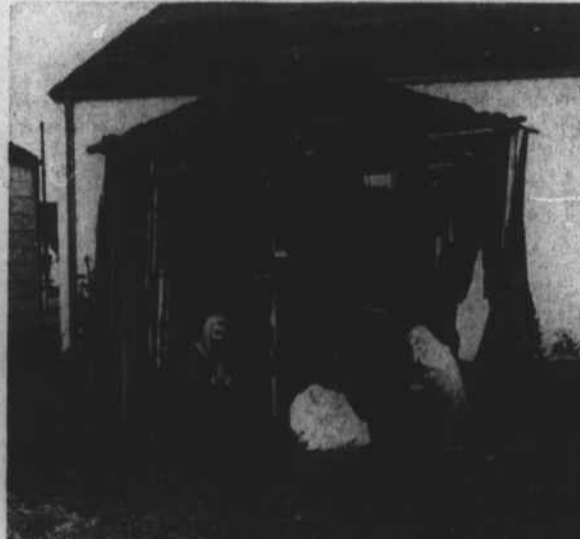
The First Christian Church, 23rd and Bridges Streets, Morehead City, portrays the birth of Christ in a manger.

Morehead City firemen answered a false alarm Tuesday night about 8:30. The alarm came in from box 43, located at the corner of 13th and Fisher streets.