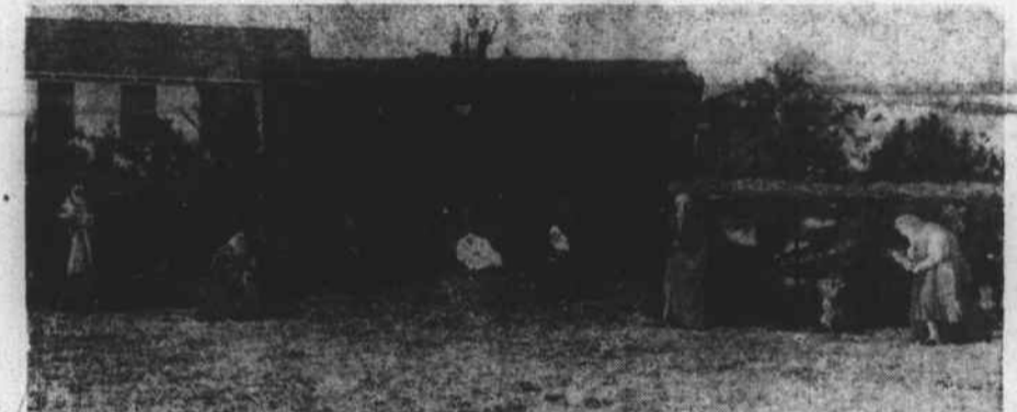
An attractive scene portraying the birth of Christ has been placed in front of Camp Glenn Methodist Church, highway 70, west of Morehead City.