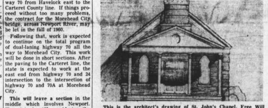
This is the architect's drawing of St. John's Chapel, Free Will Baptist Church, Stacy, as it will appear after improvements are made.