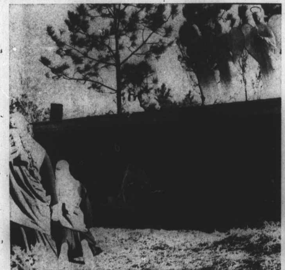
This nativity scene, with live animals surrounding the Holy Family in the stable, may be seen nightly until 10 p.m. at Core Creek Methodist Church on highway 101. The figures are life-size.