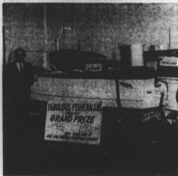
Ralph Cuthrell, Enfield, poses beside the 17-foot outboard motorboat he won in the 1959 Fabulous Fishermen contest. Cuthrell was a trophy winner in the contest and thus qualified for the drawing for the grand prize which was held at Capt. Bill's restaurant Dec. 8.