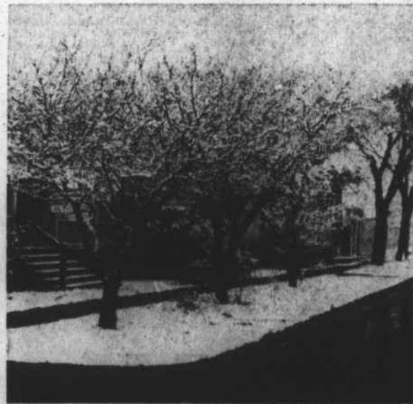
The snow made crepe myrtle trees on Ann Street, Beaufort, look like fine etchings. It lay heavily on grass and trees but melted on streets and sidewalks.