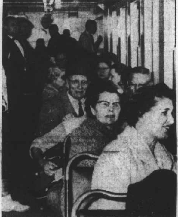
Passengers ride in comfortable seats in one of the heated lounges.