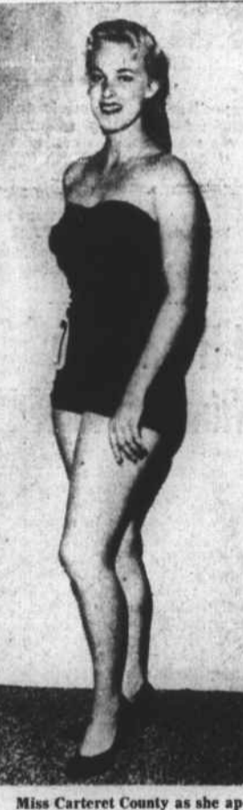
Miss Carteret County as she appeared in bathing suit.