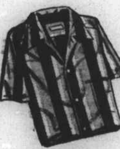
KNIT SHIRTS $2.99