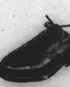
DRESS SHOES $7.99 up

"OLD SPICE" Toiletries For Men Sets From $1.00 up