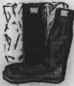
SOCKS 59c up