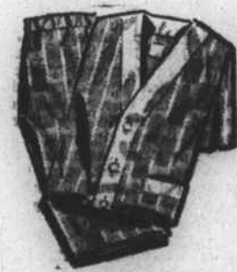
PAJAMAS $1.00 Box