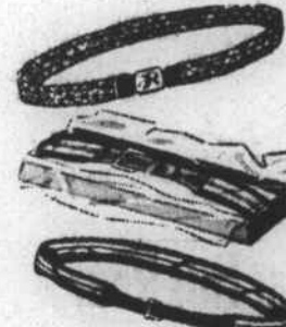
BELTS $1.00 and $1.50