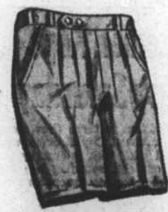
WALKING SHORTS $3.99