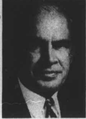
Governor Luther Hodges