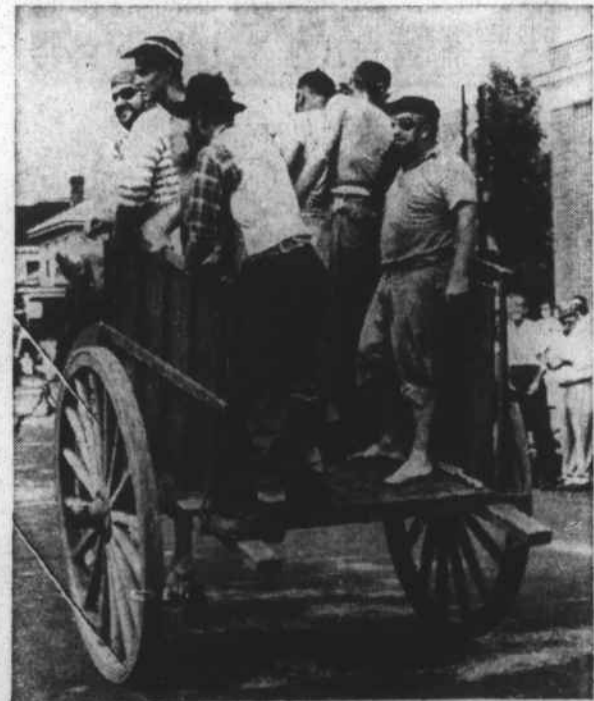
Right prevails and the bloody invaders are hauled off to jail. The men re-enacted the invasion of Beaufort by Spanish privateers in 1747.