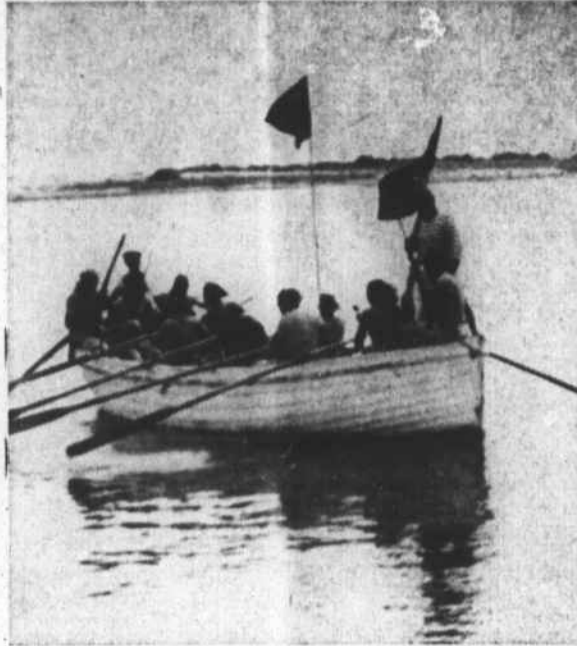
Flying the Jolly Roger, pirates row ashore on Beaufort's waterfront Saturday afternoon. In real life, these buccaners are members of the Beaufort volunteer fire department.