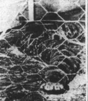
In the reptiles exhibit is this life-like eastern diamond-back rattlesnake which at one time lived in the vicinity of Havelock.