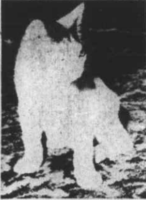
W. J. Mishaal, Beaufort, owns this cat, a cross between a cat and rabbit. Note its hind leg — formed exactly like a rabbit's.