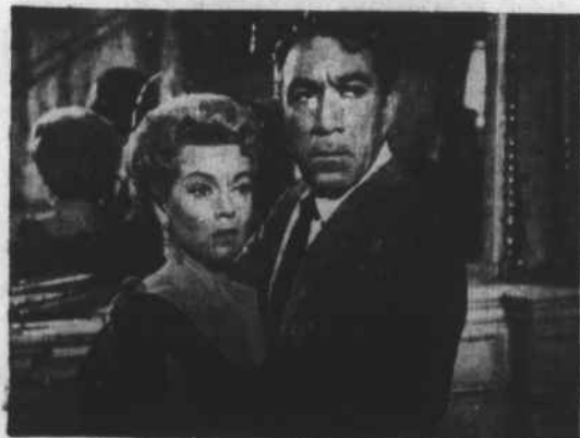
Secret lovers Lana Turner and Anthony Quinn are startled from an embrace by an unexpected visitor in this scene from the suspense melodrama, "Portrait in Black," filmed in color by producer Ross Hunter for Universal-International with an all-star cast.