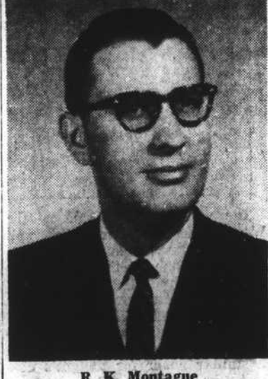
. . . postmaster