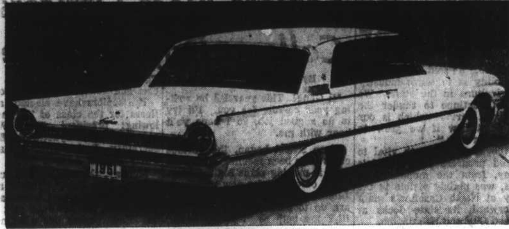
The 1961 Ford Galaxie Club Victoria, a new model in the Ford line that will be introduced to the public Thursday, features crisp, new styling that has been honored by an international fashion authority in Rome for its "functional expression of classic beauty."