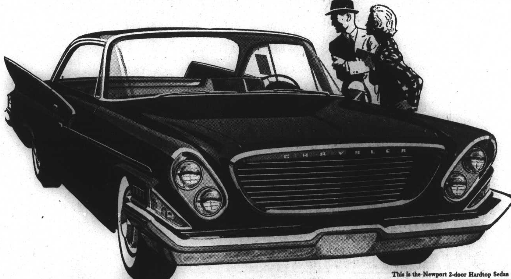
This is the Newport 2-door Hardtop Sedan

Others in Chrysler's price class are building Jr. editions for '61. Not Chrysler! Why? Because Chrysler's reputation has always been based on full-size, full-value cars. Result: your investment in a Chrysler will not be compromised by lesser cars bearing the Chrysler name.