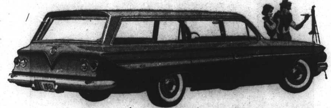
NOMAD 9-PASSENGER STATION WAGON . You have a choice of six Chevrolet wagons, each with a cover-stored cargo opening nearly 5 feet across.