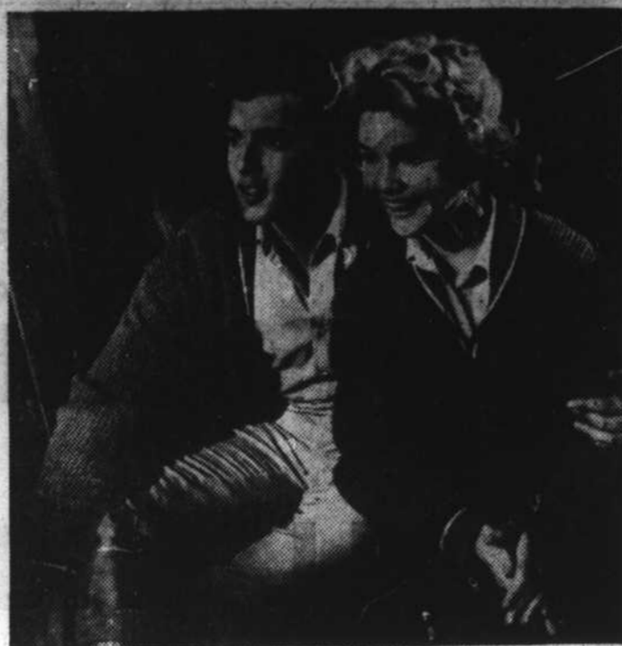
Fabian, Tuesday Weld appear in comedy, High Time, starring Bing Crosby.

The comedy ball starts rolling from the minute Bing Crosby, a 51-year-old self-made millionaire decides he wants a college education and enters as a freshman at Pinehurst College. (You may remember reading about this picture,