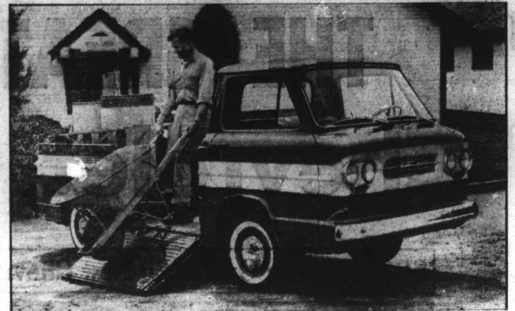
With an exclusive hinged side-loading ramp, the Chevrolet Corvair 95 light-duty truck offers economical operation, low loading height, easy handling and large cargo space for its size.