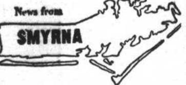
News from SMYRNA