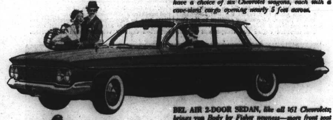
BEL AIR 2-DOOR SEDAN , like all '61 Chevrolets brings you Body by Fisher newness—more front seat leg room.