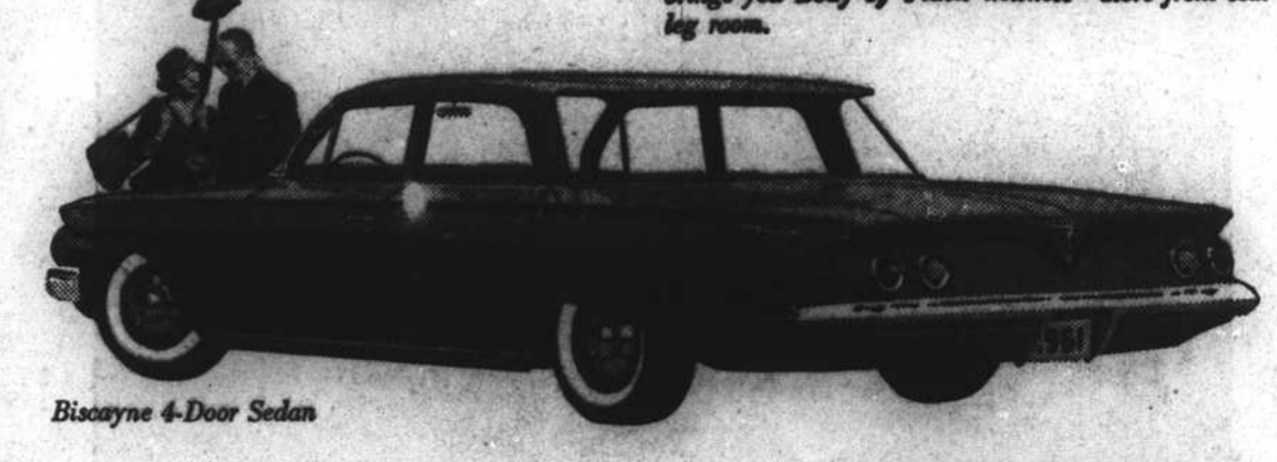
Biscayne 4-Door Sedan

See the new Chevrolet cars, Chevy Corvairs and the new Corvette at your local authorized Chevrolet dealer's