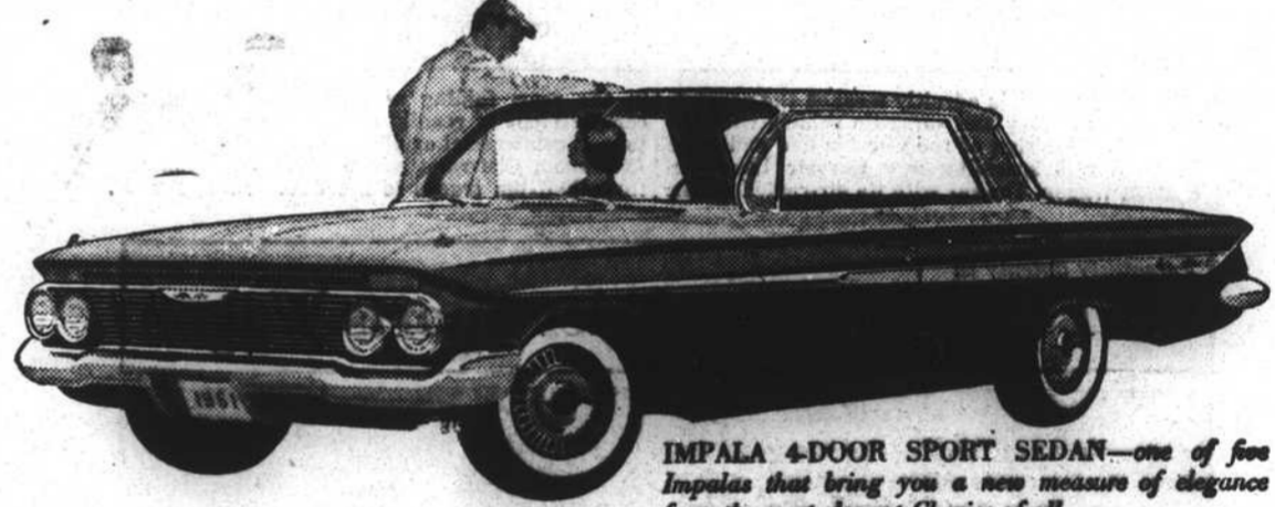
IMPALA 4-DOOR SPORT SEDAN —one of five Impalas that bring you a new measure of elegance from the most elegant Chevies of all.

Chevy's new '61 Biscaynes—6 or V8—give you a full measure of Chevrolet quality, roominess and proved performance—yet they're priced down with many cars that give you a lot less! Now you can have economy and comfort, too!