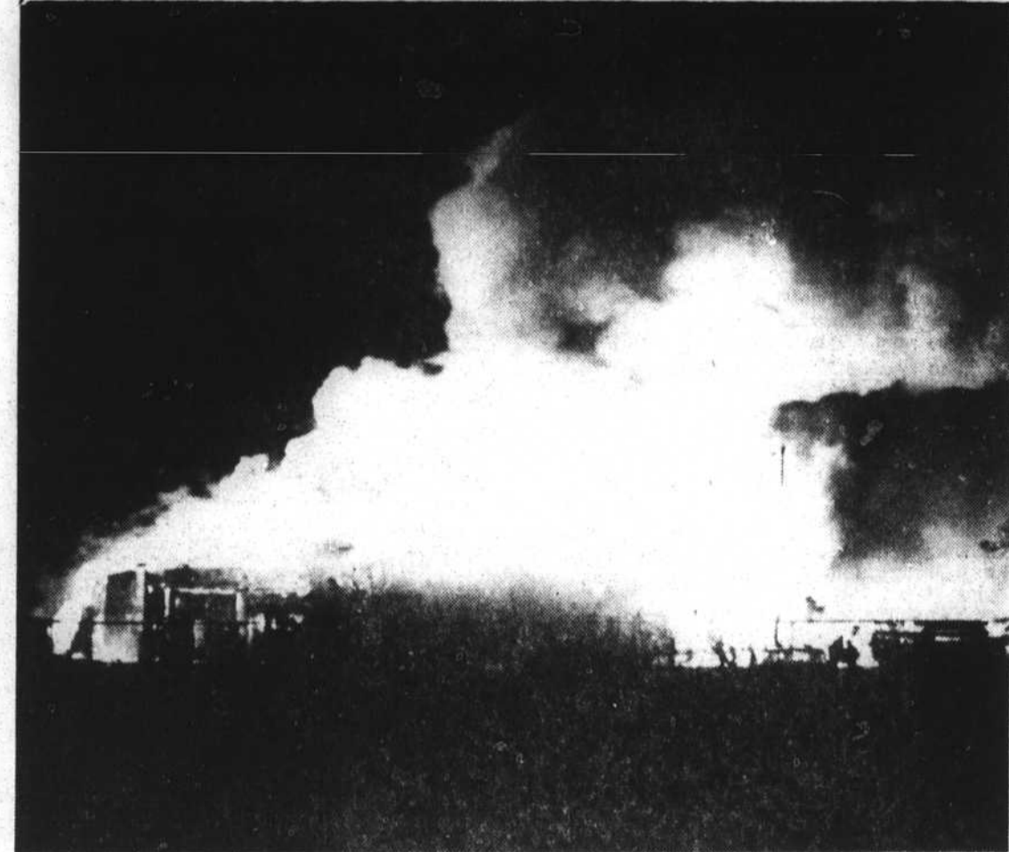
From a distance, the burning plant was a red inferno. Spectators and their cars hampered fire trucks. Some firemen had to walk more than a block to get to the fire.