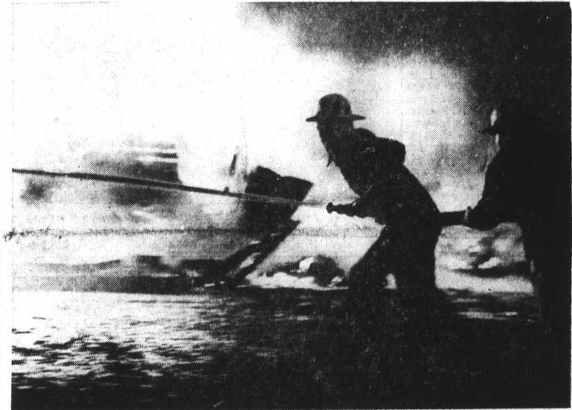
Two firemen, silhouetted against the searing flames, direct water on corrugated tin, which was collapsing under the heat. Some tin, propelled by explosions, would sail—red hot—through the air.