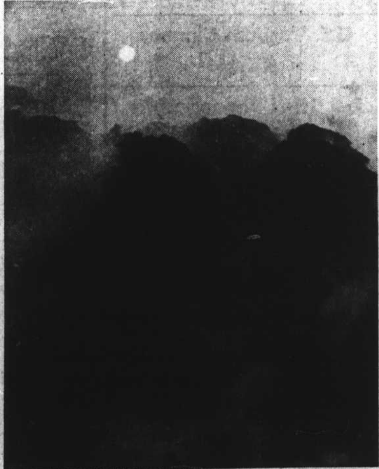
And the sun shall be obscured at noon-day . . . Smoke from the smoldering heaps of fish scrap makes the sun a dull yellow disc in sky Saturday morning.