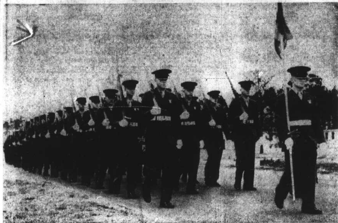
Marching in the Armed Forces Day parade at 3:30 today in Beaufort will be the combined honor guard of the Second Wing and air station, Cherry Point.