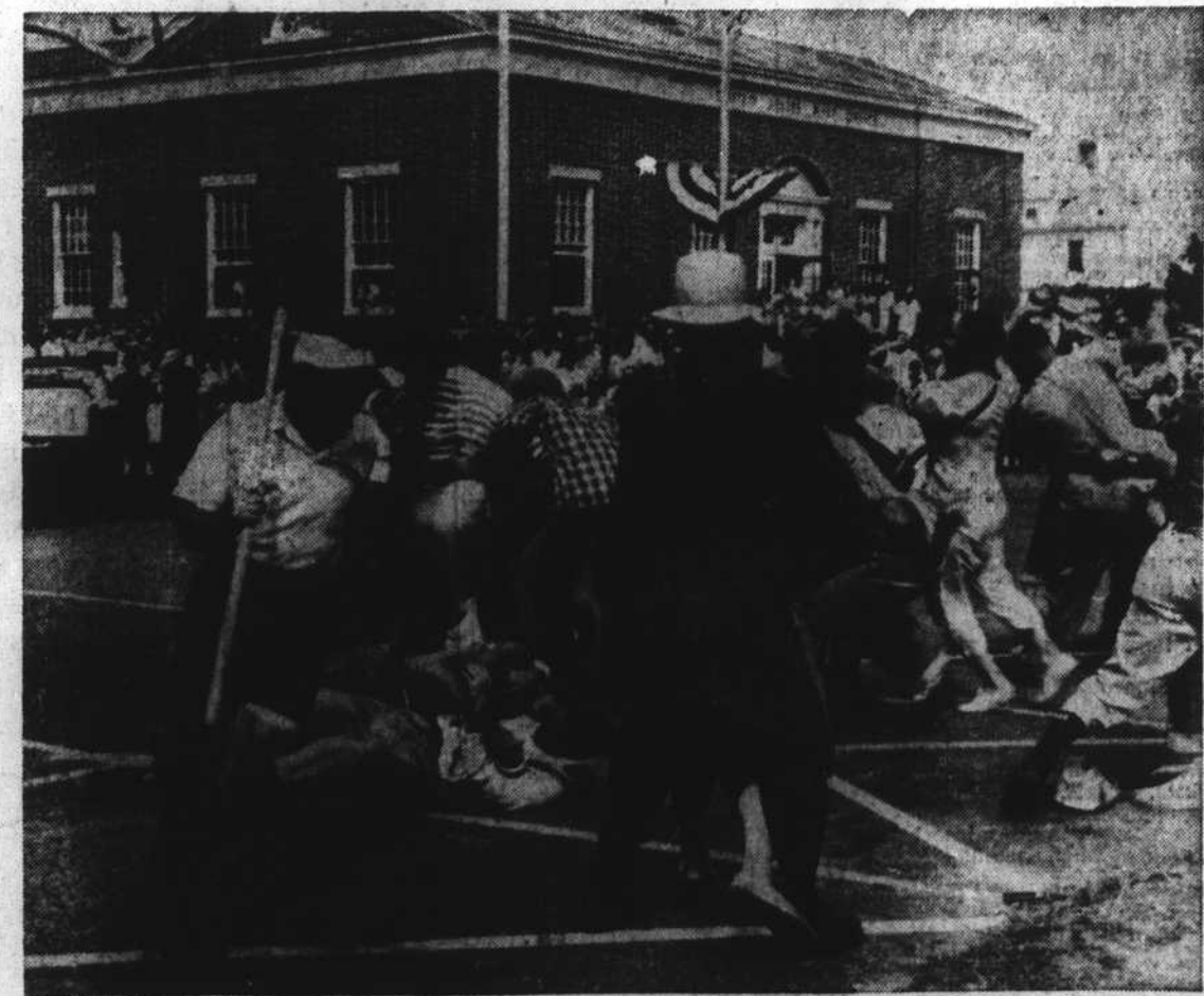
Townsmen and farmers rally to drive the Spaniards off the streets of Beaufort in the first reenactment of the Spanish pirate invasion last July. The Beaufort Historical association promises a bigger and better show this coming Saturday at 3 p.m. on the Beaufort waterfront.