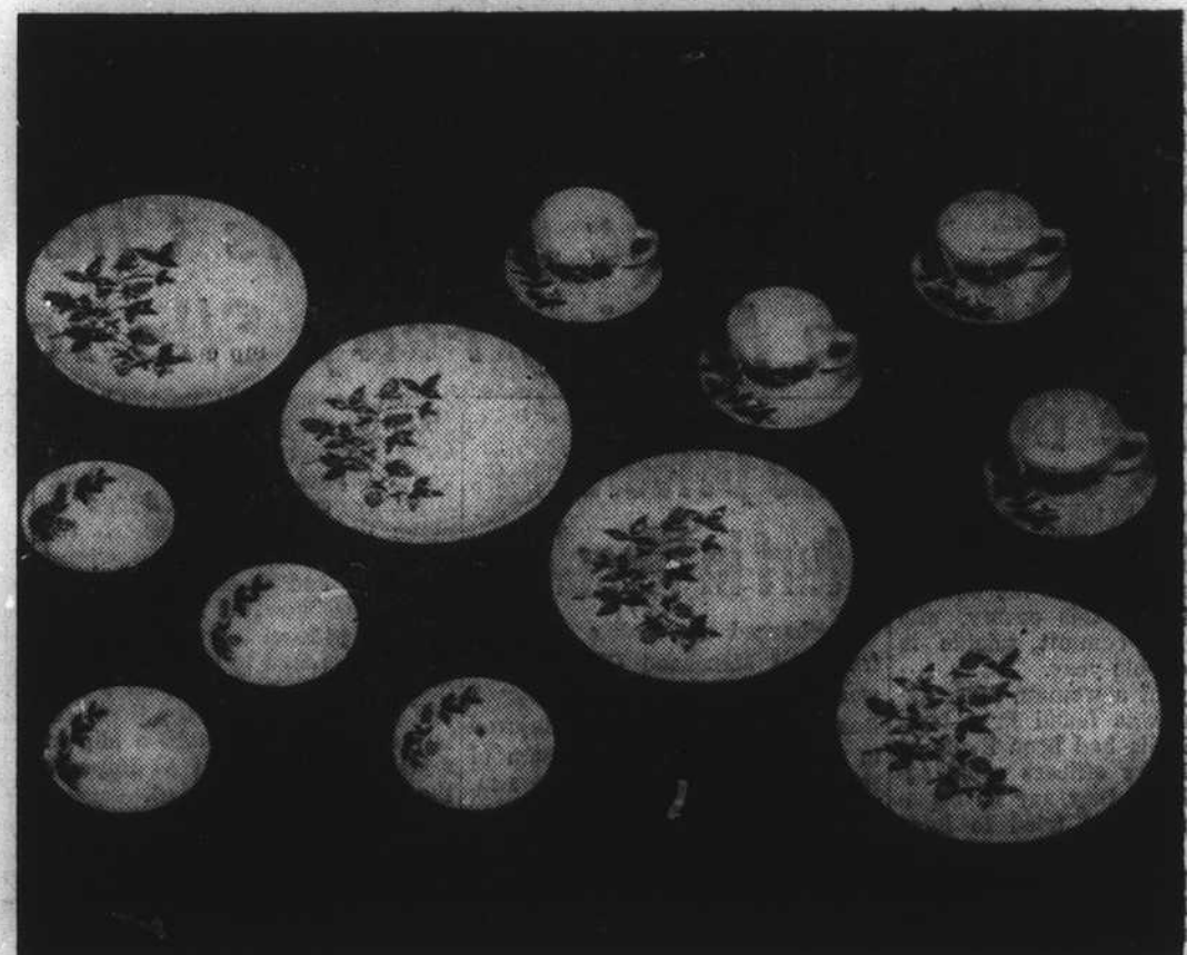
Or This Beautiful 16-Piece "Clover Blossom" Dinnerware