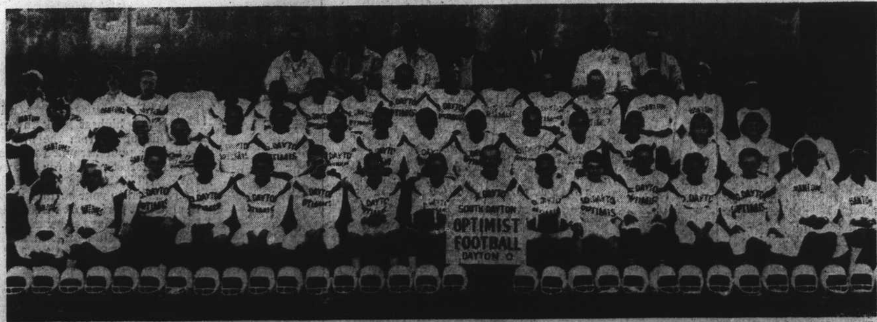
The Ohio Phantoms ghosted the Morehead City midget football team to the tune of 19-0 in the Blue Marlin bowl game Saturday night at Camp Glenn. The South Dayton team is shown here with its coaching staff and cheerleaders.