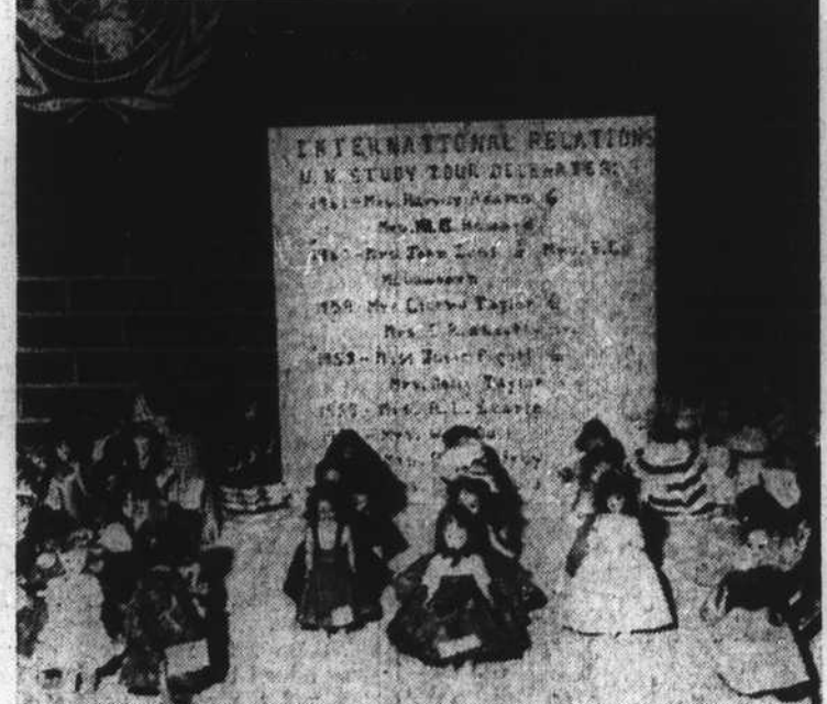
This is the international relations exhibit shown by Home Demonstration club women at their achievement program Thursday. The sign lists club members who have toured the United Nations. Dolls are dressed in costumes of different countries.