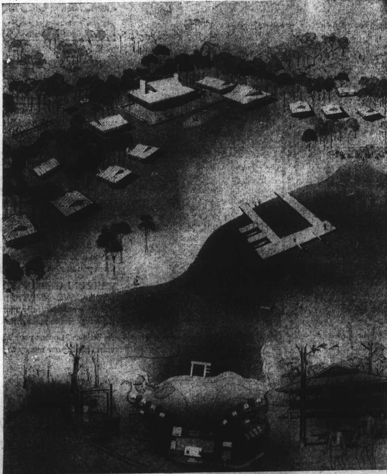
This is an architect's drawing of the proposed state 4-H camp in this county. The site is in the Merrimon section at Adams creek and Nense river. Funds are now being raised for the camp. Persons interested in contributing should mail their checks to Earl Lewis, c/o Belk's Store, Morehead City.